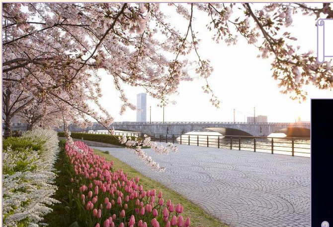
Flowers in bloom tell the coming of Spring.

Even though Niigata is a regional city, people commonly speak standard Japanese. Prices are lower compared to major cities and it's safe. In addition people in Niigata are unassuming and can't stop helping when they see foreign students trying hard in an unfamiliar place. It's an ideal environment for foreign students to concentrate on studying without anxiety.