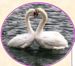
Niigata is the best city in Japan which swans fly to.